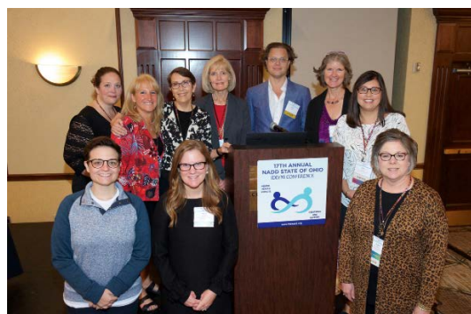
2019 Ohio In-Person Conference