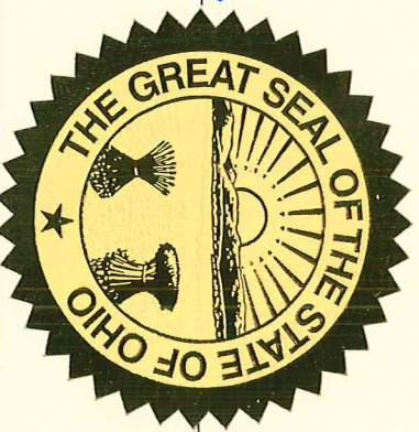
Jon Husted Lieutenant Governor